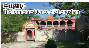
中山故居 The former residence of Zhongshan