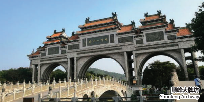
顺峰大牌坊 Shunfeng Archway